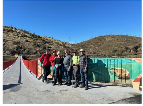
Sacramento River Trail Hike